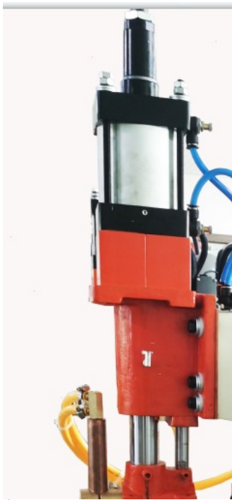
Comparison of medium frequency and power frequency welding effects

Weld nuts with an intermediate frequency welder